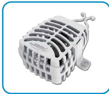
Close valve basket