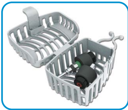
Place valves into basket

The Medical Innovations single use Valve Basket (Patent Pending) has been specifically designed to ensure effective, safe and easy decontamination of reusable endoscope valves. With its simple twist loop design Valve Basket has been designed to stay with your endoscope throughout the reprocessing cycle.