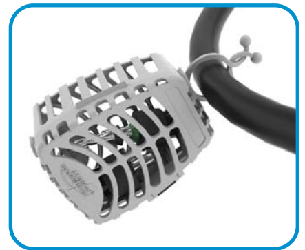
Attach basket to endoscope