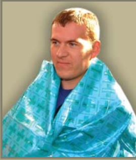
MW1002 Mediwrap® Adult Blanket NATO Supply no: 6530-99-304-5060