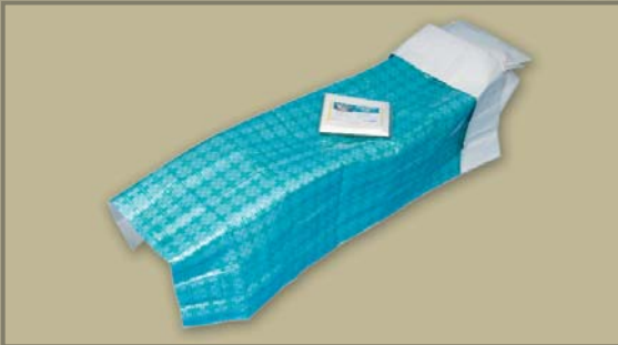
MW1009 Disposable Ambulance Pack NATO Supply no: 6530-99-297-6020