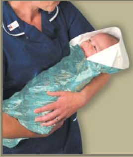
MW1006 Mediwrap® Babywrap Blanket