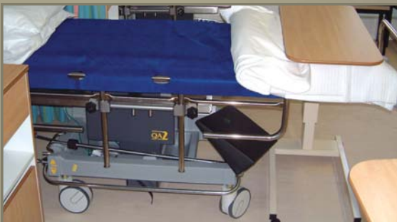
MW1029/MW1061 Flexislide® Single Use Patient Transfer Slide Sheet